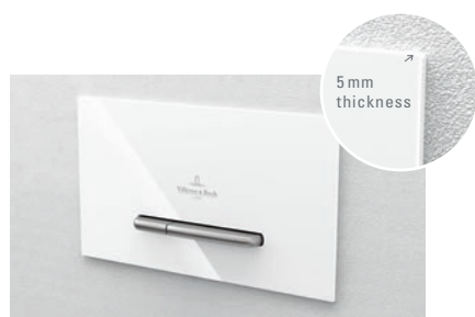
Surface-mounted (no additional parts required)

The stainless steel installation set allows the flush plates in the M300 and E300 series to be surface-mounted as well as flush-mounted.