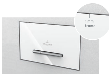
Flush-mounted with a stainless steel frame (1 mm) 922159LC installation set flush-mounted