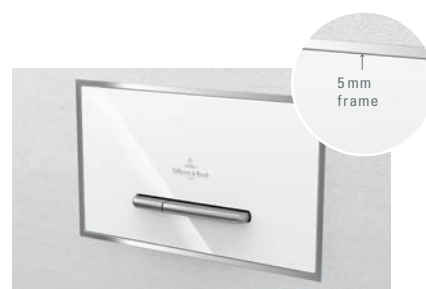
If required: 922158LC distance frame (5 mm) for covering uneven tile joints