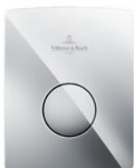
Art.-Nr.: 921944-xx Material: Plastics

The 3 urinal flush plates blend perfectly with any bathroom style thanks to their sleek design and when combined with the toilet flush plate they give the bathroom a very attractive overall impression.