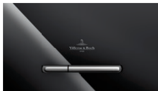
Art.-Nr.: 922160-xx Material: Glass

COLOUR VARIATIONS (FLUSH PLATE/PUSH BUTTONS)